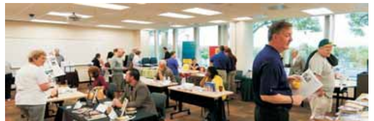
The Showcase at the University of Phoenix Chapter's Writers' Expo

at first when thinking of professionally writing. He tells us, "I believe each of us has a story to share that just might help others, but it boils down to a matter of commitment." He tells us that the San Diego Team is looking forward to their next Writers' Expo and they are willing to coach other chapters on how they can launch their own expo.