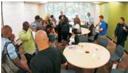
One of the Six Workshops

Topics of the workshops included E-Publishing, Writing to Advance your Career, Monetizing your Writing through Articles, Protecting your Literary Rights through Copyright, and Academic Publishing.