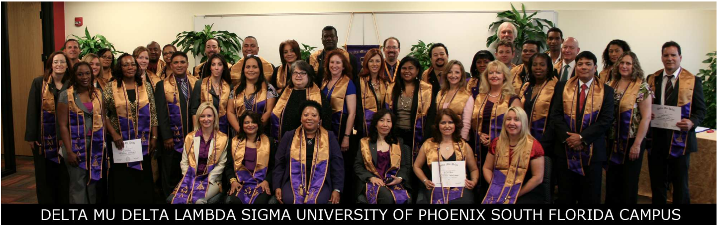
DELTA MU DELTA LAMBDA SIGMA UNIVERSITY OF PHOENIX SOUTH FLORIDA CAMPUS