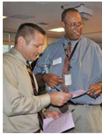
Members ponder human bingo spaces.