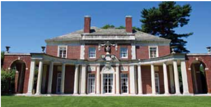
The deSeversky Center at NYIT