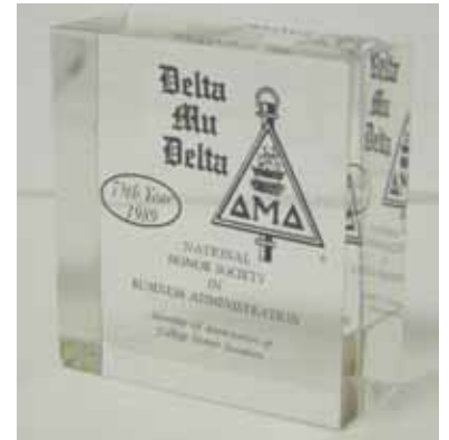
75th Anniversary Paper Weight

Of course panel discussions and breakout sessions were held on topics that still interest us today: communication, membership, fundraising, activities and programming, and chapter meetings were discussed. One of the concerns discussed was moving the society into the information age. It was referred to as “automation” in the planning phase of the triennial. By the time discussion notes were published, this topic bore the name “Computer Use in DMD” and contained suggestions on how computer use could benefit the chapters. One of these suggested that we time the requests for special runs to coincide with the data processing schedule. That reminds us that this was 1989 and personal computers on our desks were a rarity.