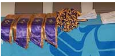
The table is set for the Charlotte co-chapter ceremony. Cords, certificates and stoles, displayed on the University of Phoenix cloth, await new members.

The chapter held its first meeting on March 12, 2011. On the meeting agenda was the election of officers from its new student member base from which nominations poured in quickly for the positions. The first meeting included guest speakers from the community and guidance from the co-advisers on how the chapter can take an active role in their community.